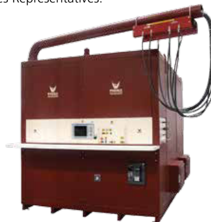
Model MTS1000R-800 with Swivel Boom