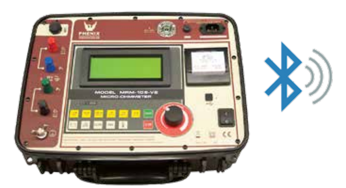
Model MRM-10E-V2 10 Amps with enhanced accuracy