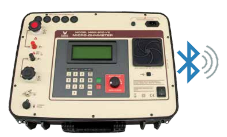
Model MRM-200-V2 200 Amps