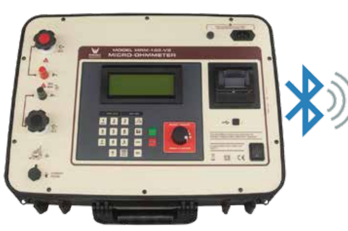
Model MRM-100-V2 100 Amps